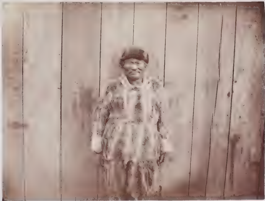
| 9. Esquimau Pilot.